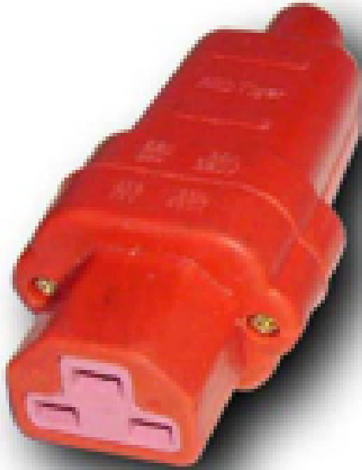
A/C13 PRESA TRIPOLARE TEDESCA IN SILICONE