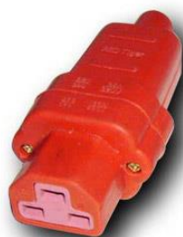
A/C13 PRESA TRIPOLARE TEDESCA IN SILICONE