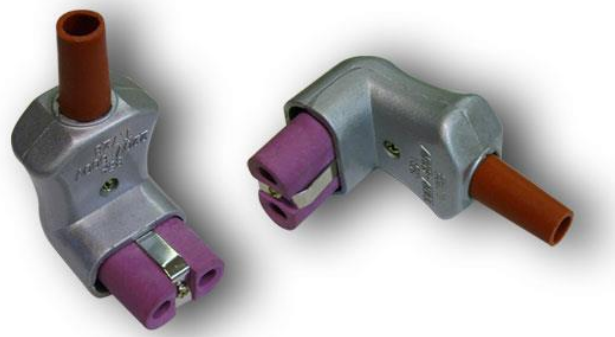
A/728-CER PRESA A PIPA IN METALLO/CERAMICA