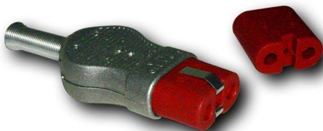
A/727 PRESA DRITTA IN METALLO/SILICONE