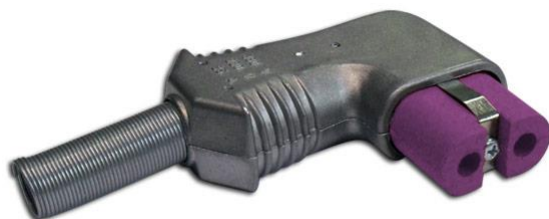
A/729-CER PRESA A SQUADRA IN METALLO/CERAMICA