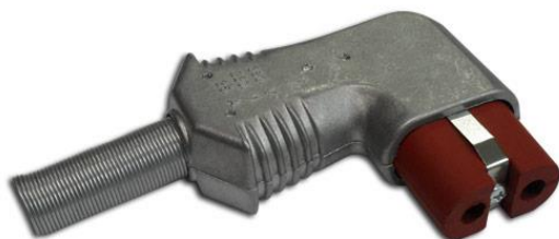
A/729 PRESA A SQUADRA IN METALLO/SILICONE