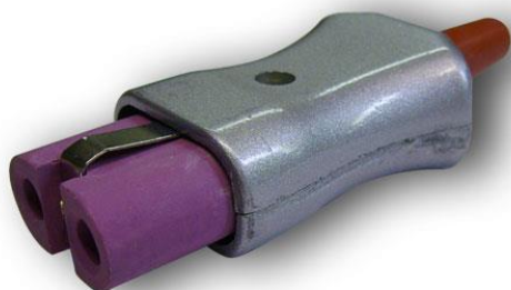
A/727-CER PRESA DRITTA IN METALLO/CERAMICA